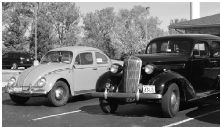
Several people drove their vintage automobiles on the tour. A nice sight.