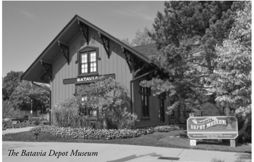
The Batavia Depot Museum

The Depot Museum is located along the Fox River at 155 Houston St, Batavia, IL