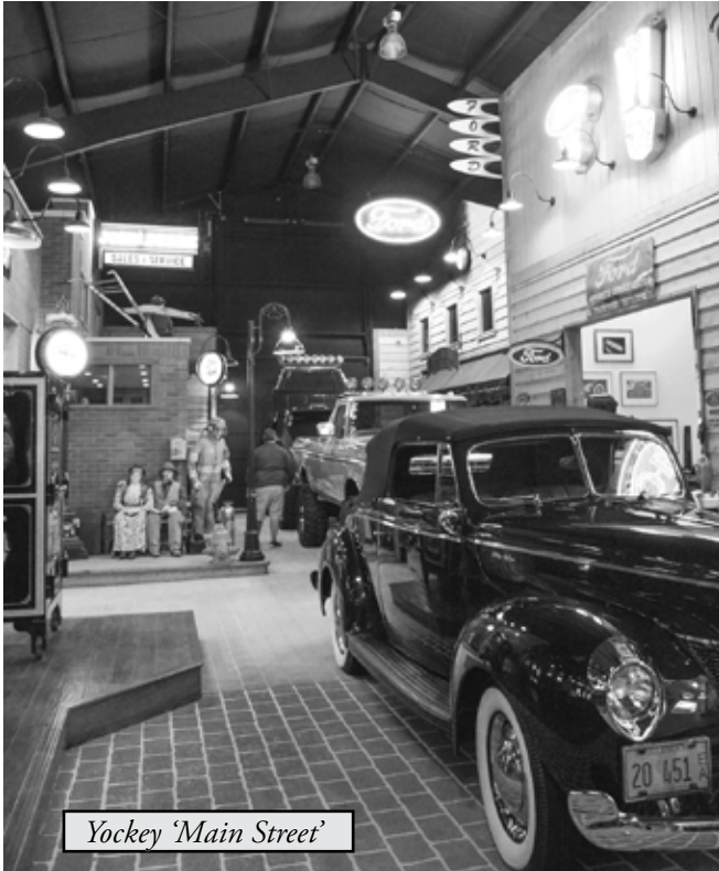
Yockey 'Main Street'