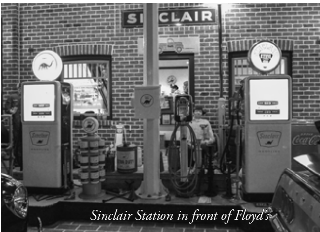
Sinclair Station in front of Floyd's