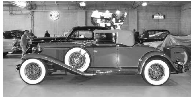
1930 Cord L29