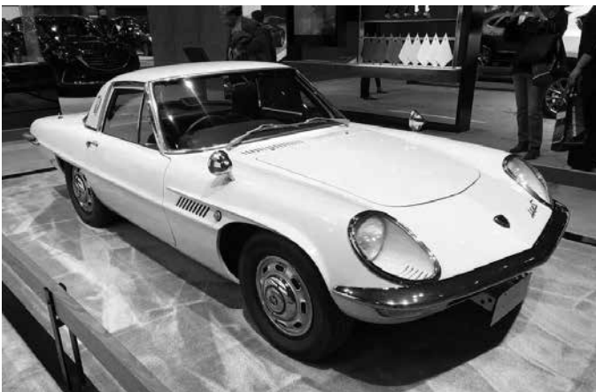
(above) A rare 1967 Mazda(nc) Cosmo Sport with rotary engine. Only a handful were built.