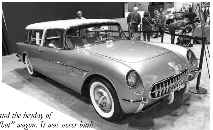
(right) A first generation Corvette(nc) concept car. It was the fifties and the heyday of the station wagon. Someone thought there would be a market for a "hot" wagon. It was never built.