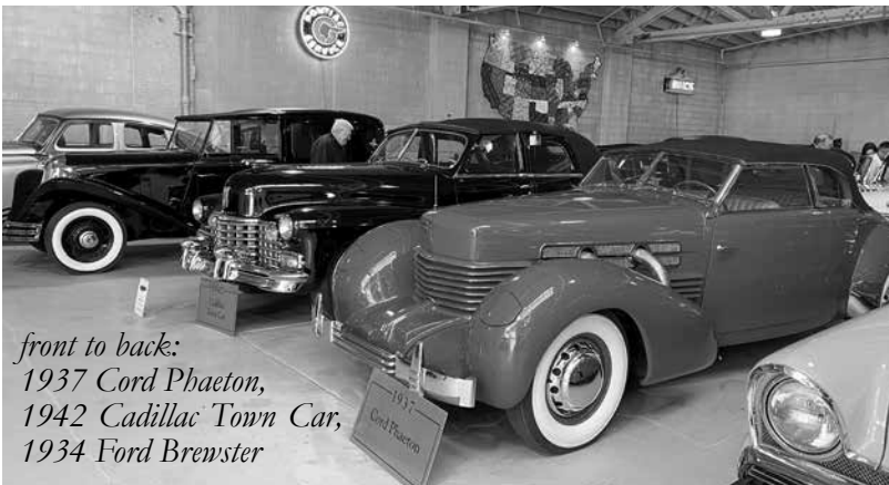
front to back: 1937 Cord Phaeton, 1942 Cadillac Town Car, 1934 Ford Brewster

What a treat to be able to get up close to this 1933 Pierce Arrow - Silver Arrow. (Our cover car from Summer 2018) Definitely a crowd favorite!