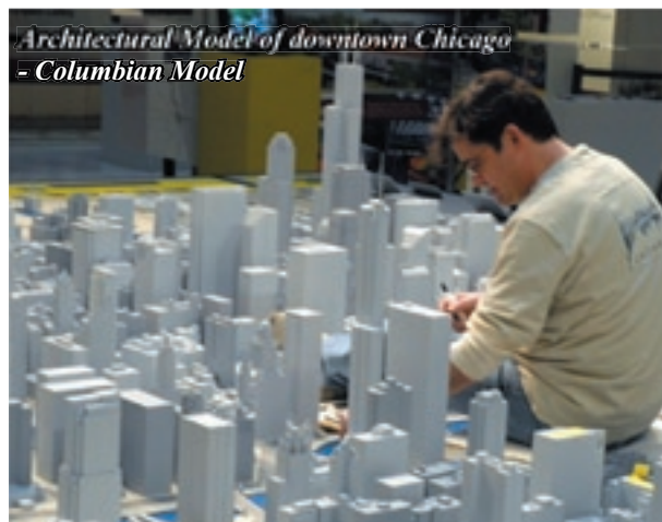
Architectural Model of downtown Chicago - Columbian Model