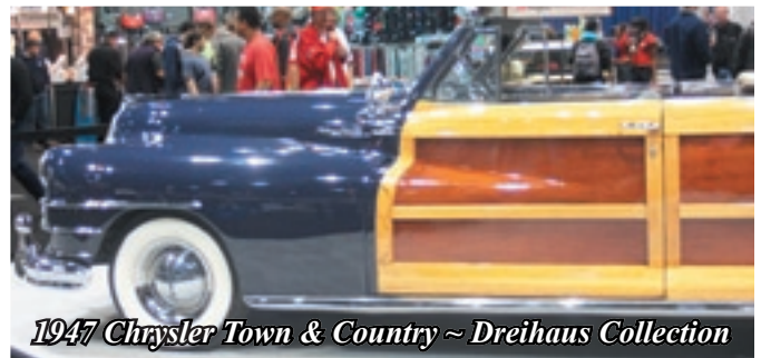
1947 Chrysler Town & Country ~ Dreihaus Collection