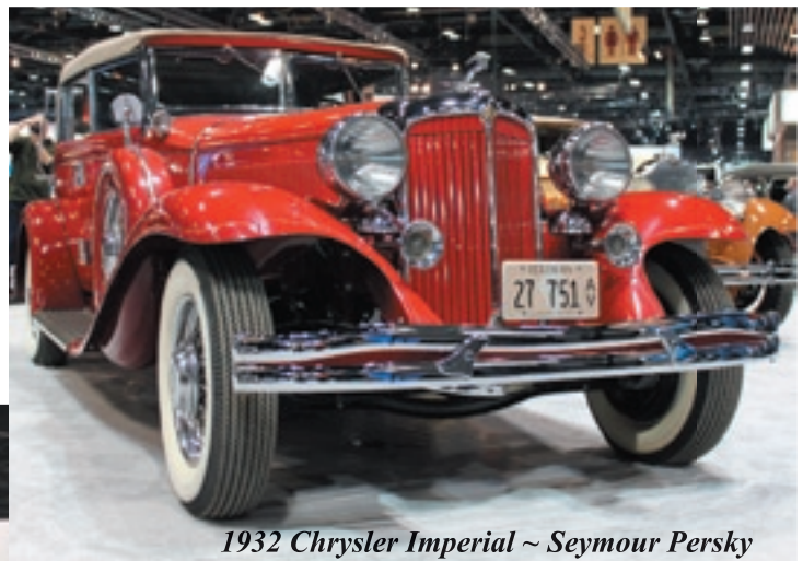
1932 Chrysler Imperial ~ Seymour Persky