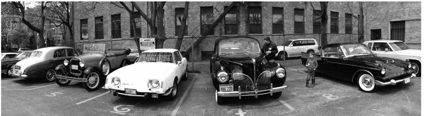
Some great cars filled the parking lot...