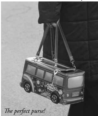
The perfect purse!