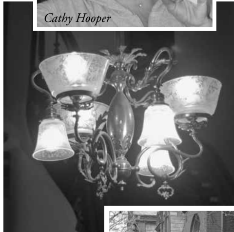
Details, inside and out.